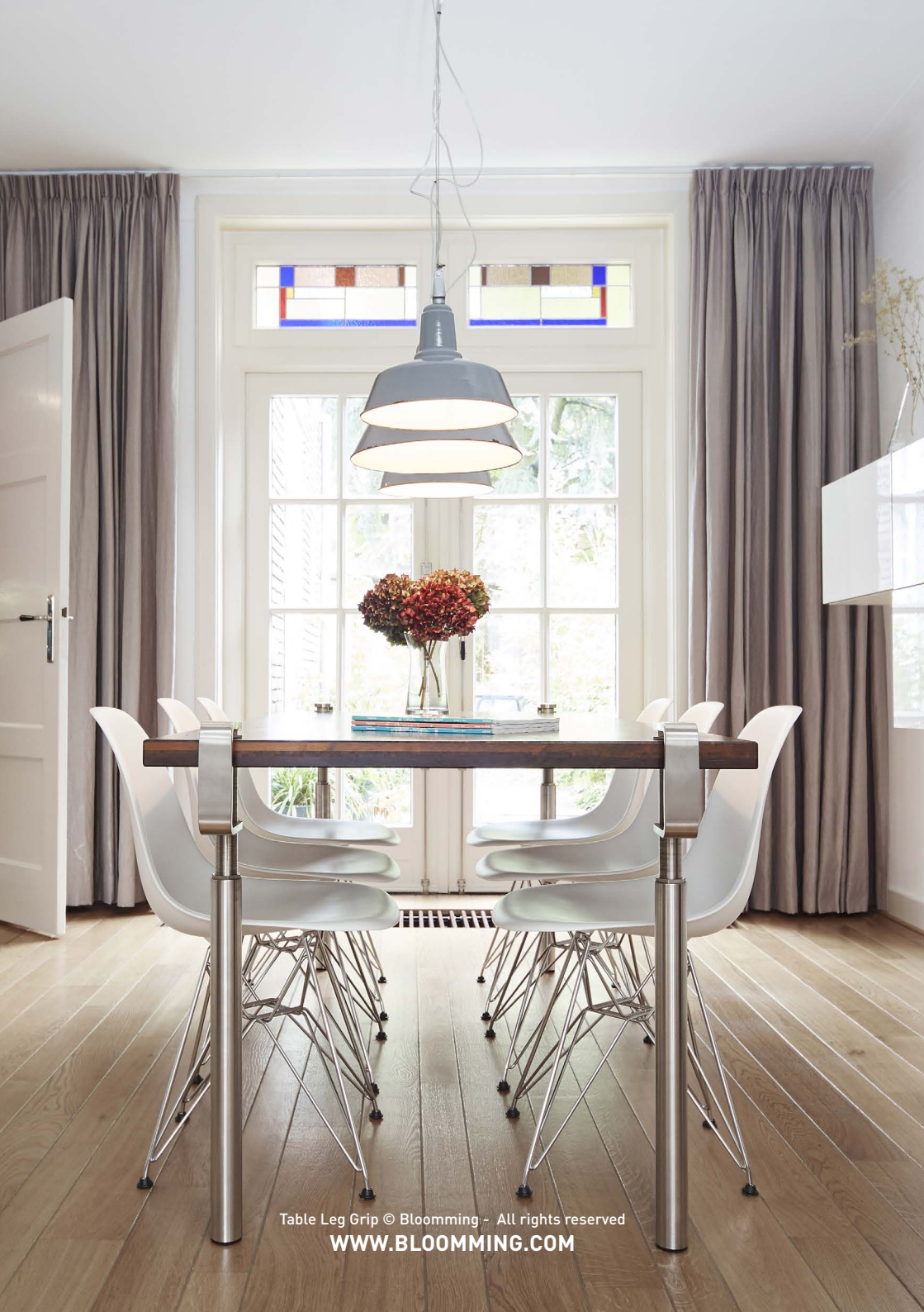
Table Leg Grip © Blooming - All rights reserved WWW.BLOOMMING.COM