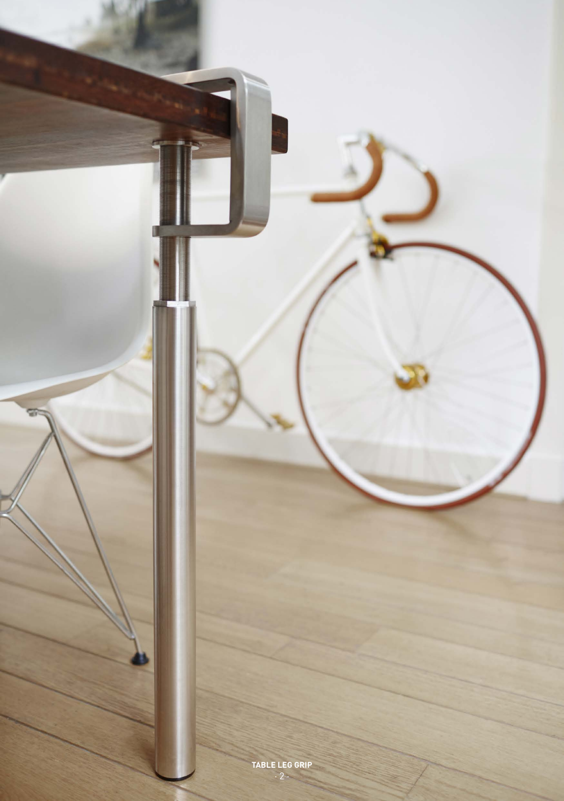
TABLE LEG GRIP