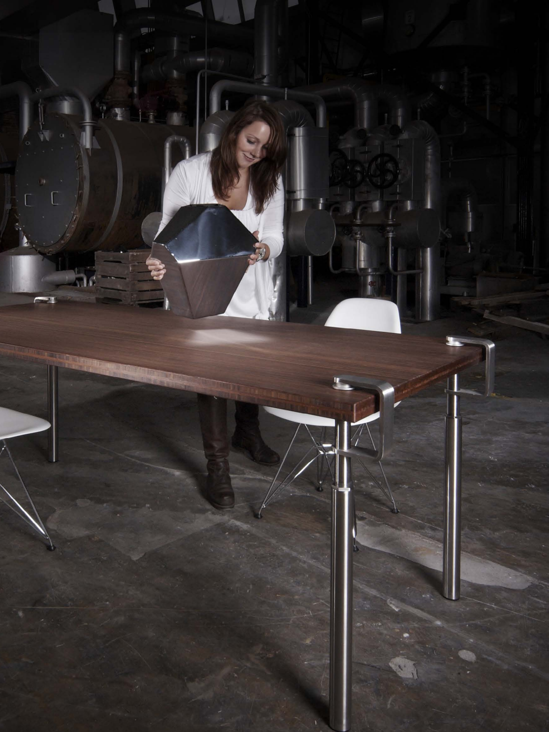
TABLE LEGS GRIP + BAMBOO SIDE-PRESSED THERMO TABLE TOP